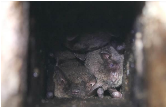
Figure 5. The roosting site of Myotis hasseltii beneath the bridge of Thelgamuwa Oya on the Raththota-Pallegama road near Ilukkumbura (first recorded by Wellappulli-Arachchi et al. 2014).

M. hasseltii had been previously recorded roosting either singly or in small groups, in caves, cracks in tree-trunks or bamboo, crevices in rock outcrops, and fissures in abandoned buildings or archaeological ruins (Phillips 1935, Bates & Harrison 1997, Francis 2008). Our observation of this particular roosting site is also in accordance with previously published literature. The locality we reported herein retained much natural land-cover, but has undergone anthropogenic modification with construction and subsequent management of the monastery, which is occupied by people. This bat species has also been recorded from developed landscapes— such as suburbs of Hanoi in northern Vietnam— and is known to benefit from access to large water bodies. However, the bat colony (Fig. 5) which was discovered (in 2012) beneath the bridge of Thelgamuwa Oya on the Raththota-Pallegama road near Ilukkumbura (Wellappulli-Arachchi et al. 2014) disappeared when the new bridge was built, and the roosting site was completely destroyed (Fig. 6A–B).