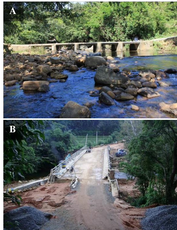
Figure 6. The bridge of Thelgamuwa Oya (A) old bridge in 2012 where Myotis hasseltii colony was found; (B) the new bridge in 2019, the roosting site was destroyed and no bats were recorded.

The distribution and conservation status of most of the Sri Lankan chiropterans, the echolocating microbats in particular, is poorly known. Exploring remote localities in Sri Lanka for bats can help fill-in these knowledge gaps, and thereby consolidate their distributional ranges and improve our understanding of their habitat associations (Nanayakkara et al. 2012, Edirisinghe et al. 2013, 2020a–b, Wellappulli-Arachchi et al. 2014). Both systematic field surveys and opportunistic excursions can contribute to developing spatially explicit data and maps on the distribution patterns of Sri Lankan bats, which is imperative for successful conservation efforts.