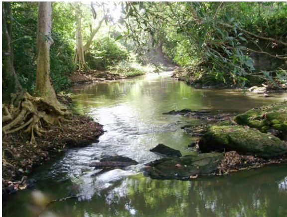
Figure 4. The riverine habitat of Myotis hasseltii in Bambaragala, Sri Lanka

M. hasseltii had been previously recorded roosting either singly or in small groups, in caves, cracks in tree-trunks or bamboo, crevices in rock outcrops, and fissures in abandoned buildings or archaeological ruins (Phillips 1935, Bates & Harrison 1997, Francis 2008). Our observation of this particular roosting site is also in accordance with previously published literature. The locality we reported herein retained much natural land-cover, but has undergone anthropogenic modification with construction and subsequent management of the monastery, which is occupied by people. This bat species has also been recorded from developed landscapes— such as suburbs of Hanoi in northern Vietnam— and is known to benefit from access to large water bodies. However, the bat colony (Fig. 5) which was discovered (in 2012) beneath the bridge of Thelgamuwa Oya on the Raththota-Pallegama road near Ilukkumbura (Wellappulli-Arachchi et al. 2014) disappeared when the new bridge was built, and the roosting site was completely destroyed (Fig. 6A–B).